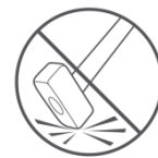
shock absorbing cap